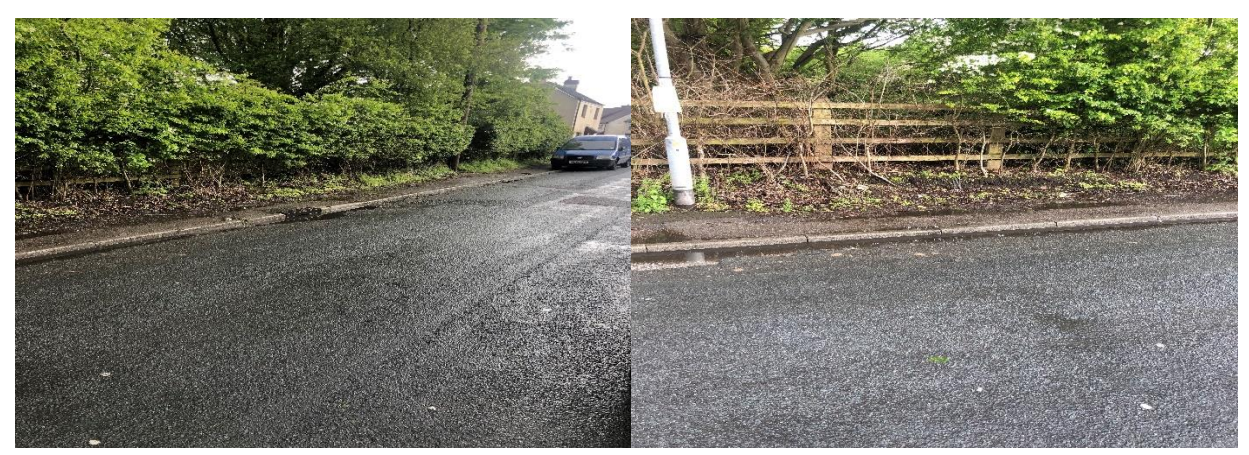
Chapel Street, clear weeds and soil to widen the path.