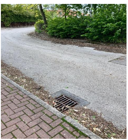
Contact Cannock Chase Council and ask the roadsweeper to attend the access road by the Hayes Green Community Centre.