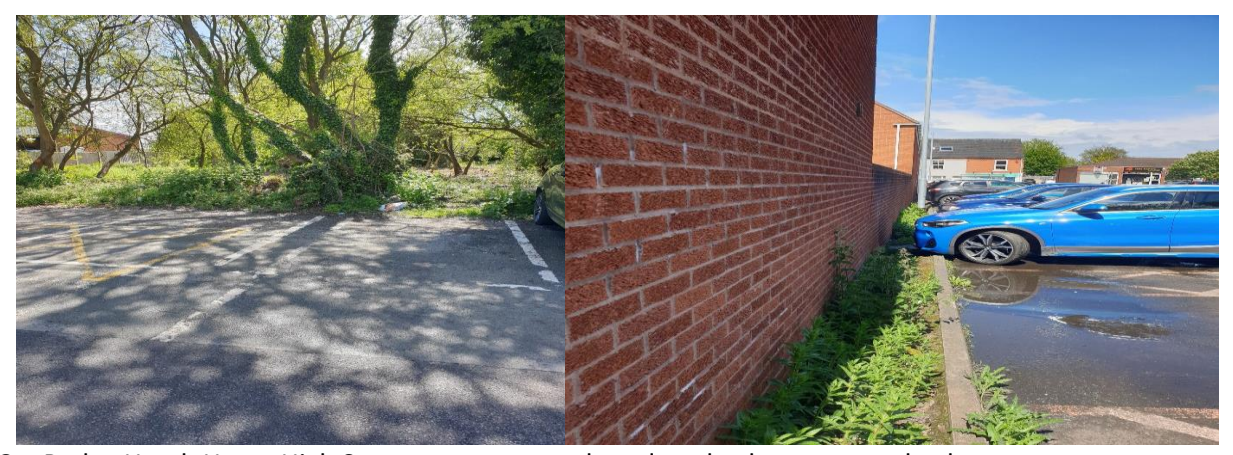
Car Park – Heath Hayes High Street, remove weeds and cut back overgrown bushes.