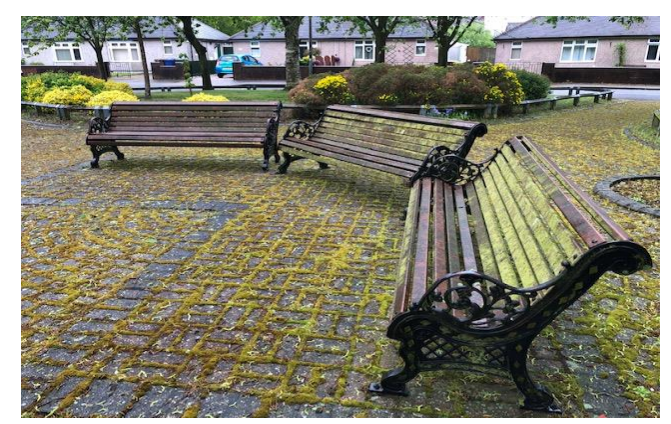
Kent Place, remove moss.