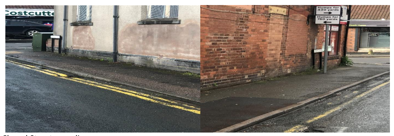
Chapel Street, weeding.