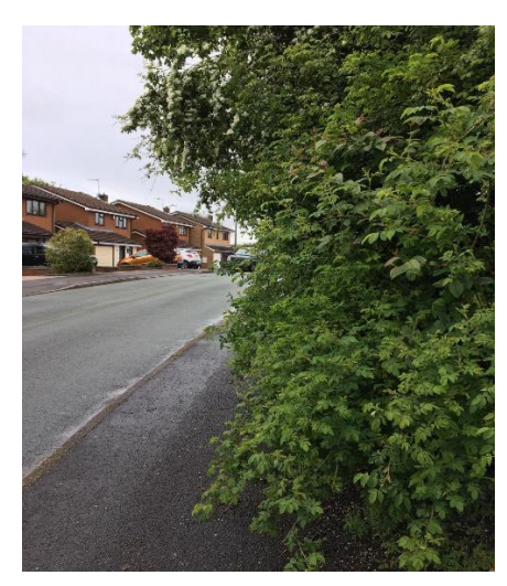
Thistledown Drive, Trim the bushes.